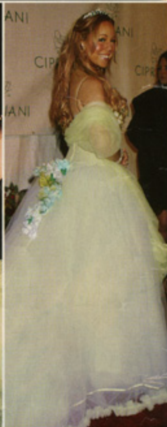
Mariah wore a vintage Vera Wang ball gown